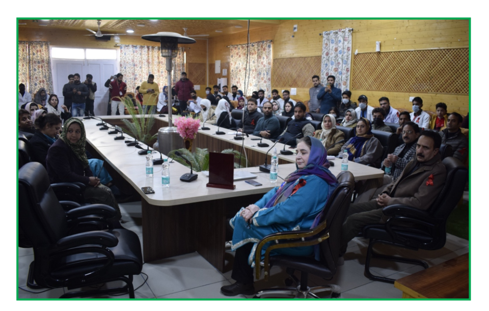
World AIDS Day