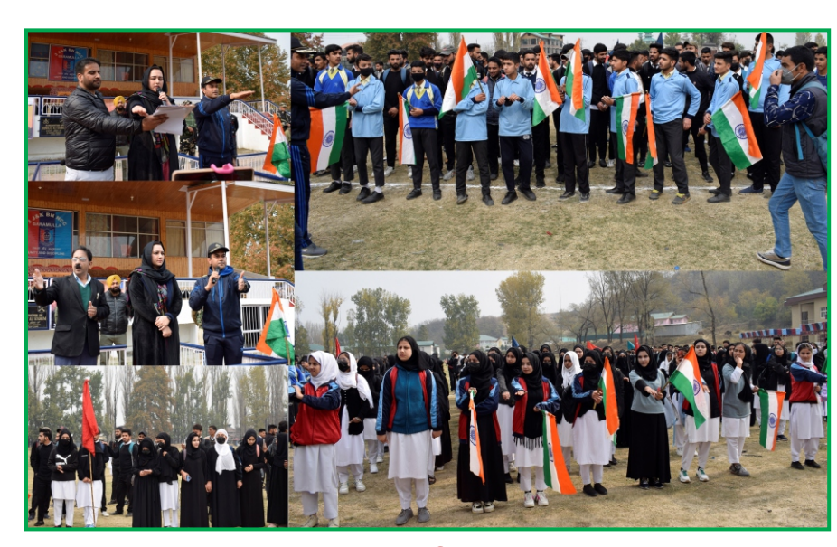
Pledge Against Substance Use