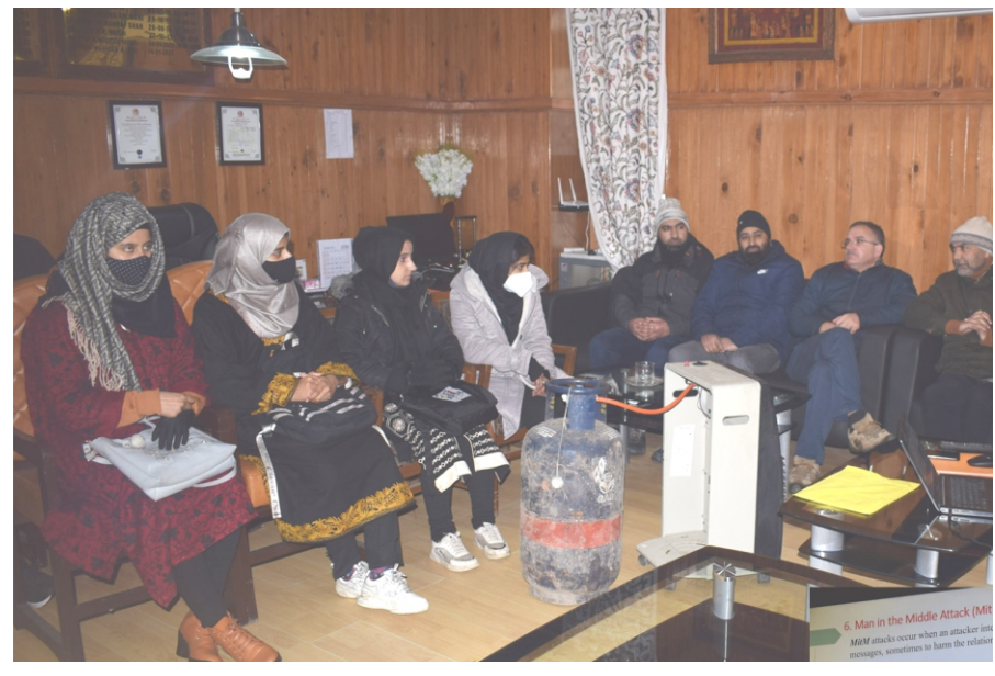
Cyber Jagrukta Divas