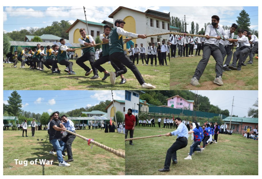
Tug of War