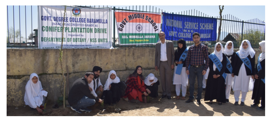
Conifer Plantation Drive by NSS at GMS Johama