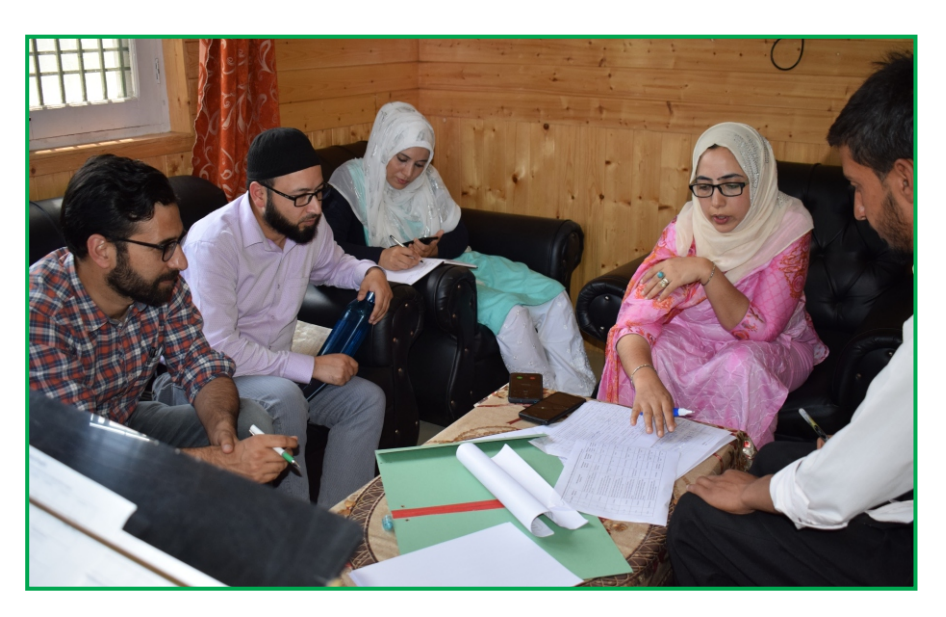
Student Induction Programme