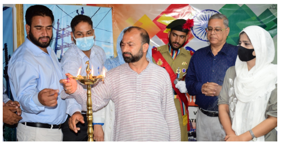
Ujjwal Bharat Ujjwal Bhavishya